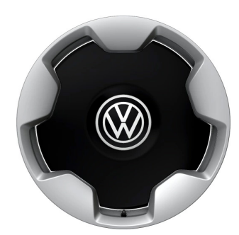
20" 'Stockton' OPTIONAL on ID.BUZZ Life, Family & Tech.

8J x 20 in front 10J x 20 in rear Silver, with plastic wheel trim (black).