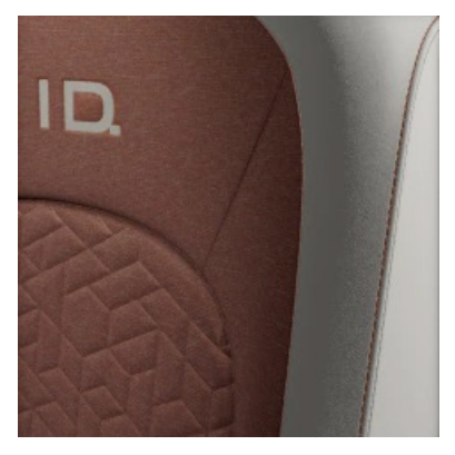
'Seaqual' seat trim Saffron Orange-Mistral/Soul-Mistral/ Black Standard on ID.Buzz Family onward Not available on ID.Buzz Life