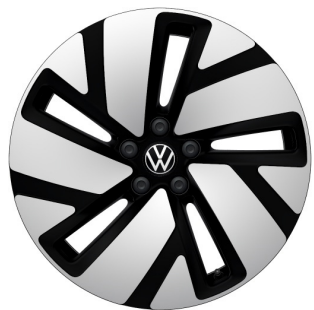
19" 'Tilburg' STANDARD ON ID.Buzz Life. OPTIONAL on ID.BUZZ Family.