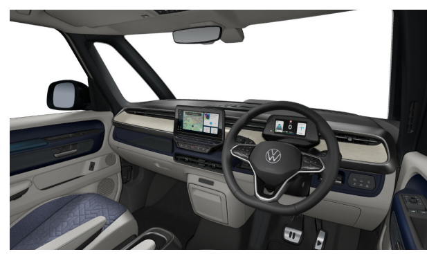
X-Blue-Mistral/Soul-Mistral/Black Standard on ID.Buzz Family onward Not available on ID.Buzz Life