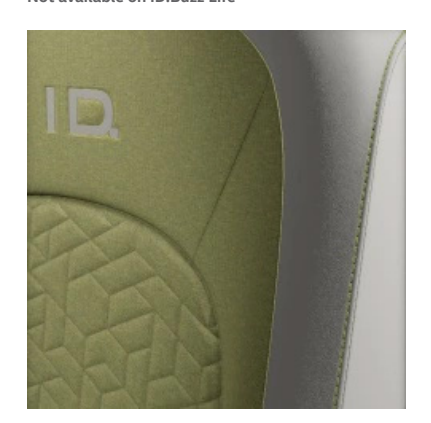
'Seaqual' seat trim Lemon-Mistral/Soul-Mistral/Black Standard on ID.Buzz Family onward Not available on ID.Buzz Life