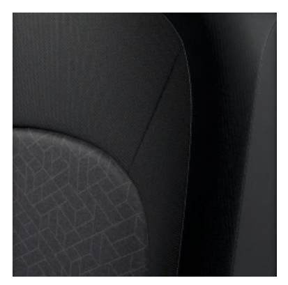
'Fabric' seat trim Palladium-Soul/ Soul-Soul/ Black Standard on ID.Buzz Life Not available on ID.Buzz Family onward