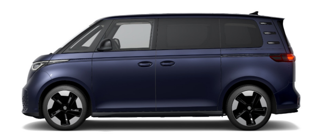
Starlight Blue Metallic<sup>1</sup>