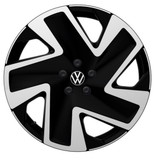
20" 'Solna' STANDARD ON ID.Buzz Tech. OPTIONAL on ID.BUZZ Life & Family.

8J x 20 in front 10J x 20 in rear Black, diamond-turned surface.