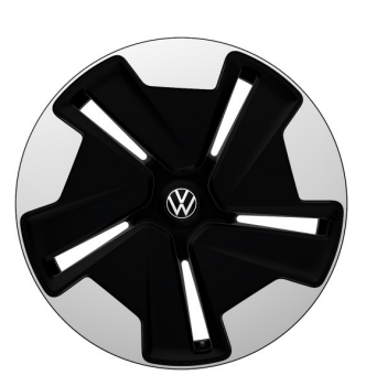
21" 'Bromberg' STANDARD ON ID.Buzz Max. OPTIONAL on ID.BUZZ Life, Family & Tech.