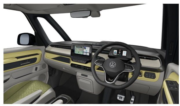
Lemon-Mistral/Soul-Mistral/Black Standard on ID.Buzz Family onward Not available on ID.Buzz Life