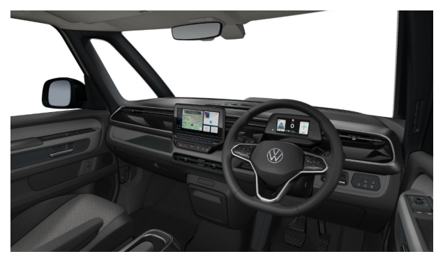
Palladium-Soul/ Soul-Soul/ Black Standard on ID.Buzz Life Not available on ID.Buzz Family onward