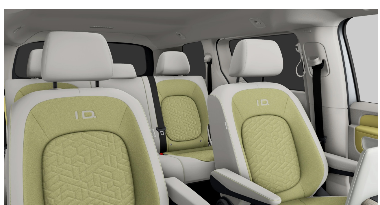
Note: Interior seat trim colours for ID.Buzz Family onward are determined by exterior colour selection. Note: The print processes does not allow exact reproduction of the upholstery & insert colours.