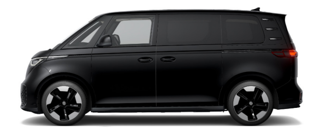
Deep Black Pearl Effect1