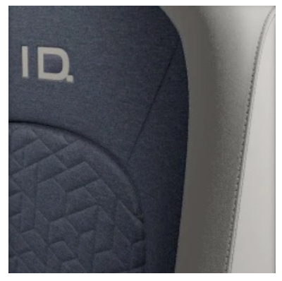
'Seaqual' seat trim X-Blue-Mistral/Soul-Mistral/Black Standard on ID.Buzz Family onward Not available on ID.Buzz Life