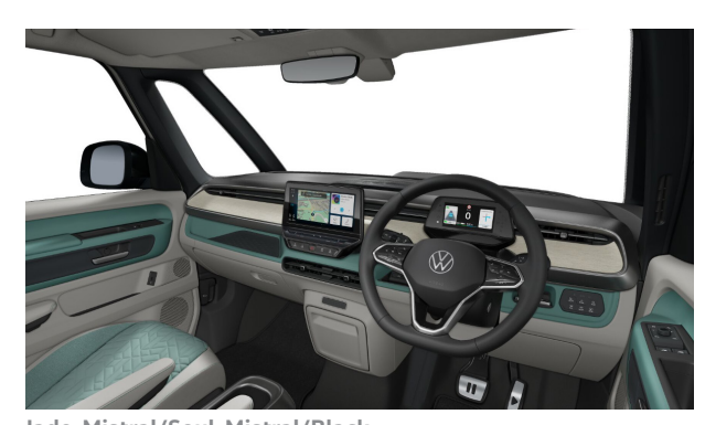
Jade-Mistral/Soul-Mistral/Black Standard on ID.Buzz Family onward Not available on ID.Buzz Life