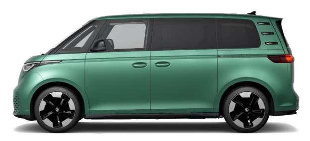
Bay Leaf Green Metallic<sup>1</sup>