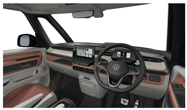
Saffron Orange-Mistral/Soul-Mistral/Black Standard on ID.Buzz Family onward Not available on ID.Buzz Life