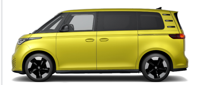
Pomelo Yellow Metallic<sup>1</sup>