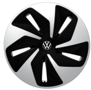
19" 'Venlo' STANDARD ON ID.Buzz Family. OPTIONAL on ID.BUZZ Life.

235/45 R21 104T XL 265/40 R21 108T XL Tyres