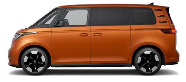
Energetic Orange Metallic<sup>1</sup>