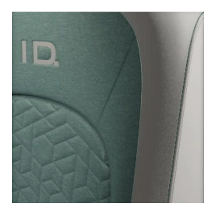
'Seaqual' seat trim Jade-Mistral/Soul-Mistral/Black Standard on ID.Buzz Family onward Not available on ID.Buzz Life